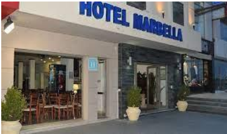
Hotel Marbella http://hotelmarbella.com.uy/