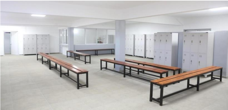
Timekeepers with Electronic System.